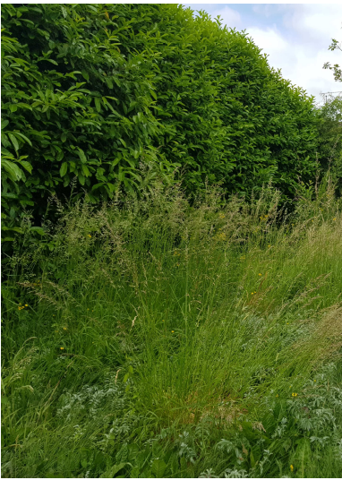
Existing Laurel hedge retained and pruned