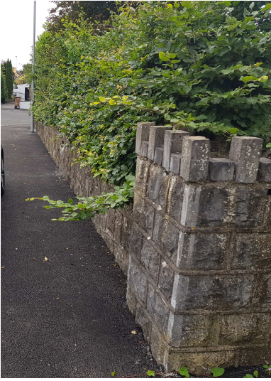
Existing Beech hedge retained and pruned